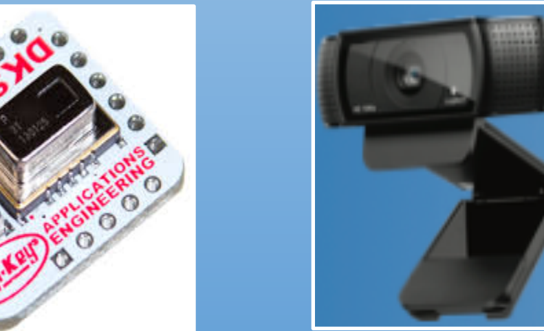
Logitech C920 Webcam Panasonic GridEYE IR Sensor

We developed a system that will inform a visually impaired person how many people are around them, utilizing a BeagleBone Black. Our system uses an infrared camera to detect the presence of an individual based on body temperature and an HD camera to capture an image. The image is then processed and the number of faces in the captured image is specified.